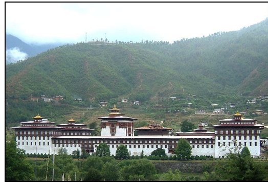
Thimphu, Capital of Bhutan

Later visit Wangdi town and stay for the night in Wangdi. Enroute visit Lama Drukpa Kuenleys Temple/Chimey Lhakhang. This is about 15minutes hike from the road.